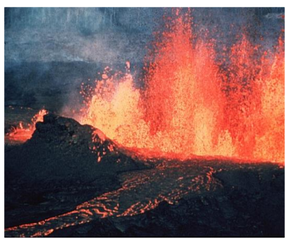
Fissure eruption of mantle plume material at the Hawaiian hot spot.

In the middle of plates, we can sometimes find volcanoes, like Kilauea in Hawaii. These volcanic areas are called hot spots and are fed by plumes of hot, partially molten rock that rises from the mantle.