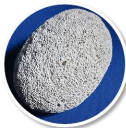
A common cosmetic tool, pumice stone comes from the top of volcanoes; the holes are empty gas bubbles.

All magma contains gas. When magma rises, the pressure on it decreases, allowing more gas to escape. By measuring changing gas emissions at volcanic vents, volcanologists can tell when magma has risen.