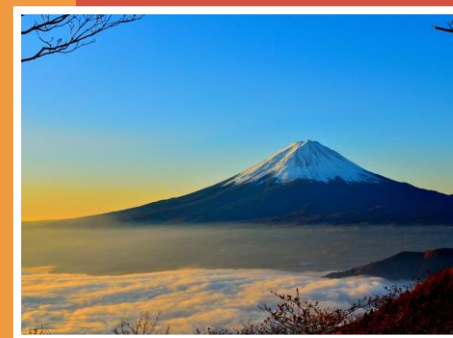
Mount Fuji, Japan. A famously stunning volcano, it attracts 300,000 climbers every summer.

There are some reasons why people might choose to live near volcanoes: volcanic materials such as ash are full of nutrients and, once broken down, they can act as a natural fertilizer (the land around Naples is intensively cultivated because of the rich soils produced by Mount Vesuvius); lava is also a good building material; the heat produced by volcanoes can be used to produce geothermal energy and the beauty of volcanic landscapes can create a great deal of wealth through tourism.