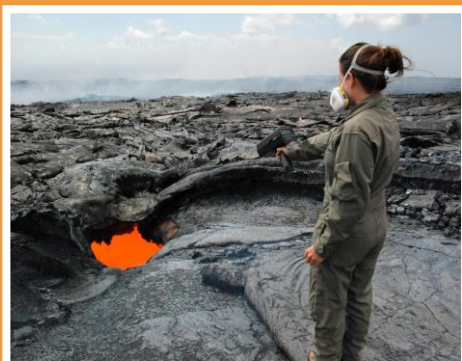
A volcanologist measures gas release from an effusive volcanic eruption

Around the world, many millions of people live on or near volcanoes. Many do so because they have no choice, and the hazard posed by a dormant volcano is negligible, until it reawakens. Although prediction has improved greatly in recent years, volcanoes can still erupt with little to no warning. When a volcano starts to ramp up to an eruption, evacuation may be the only way to save the lives of those in harm's way; but evacuation may disrupt communities, damage livelihoods and cause misery to those affected.